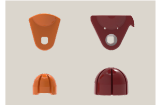
Juice extraction kits