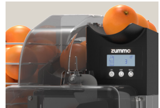
Standard Sensor Contact

The machine automatically starts up when the Contact sensor, included as standard equipment, detects the oranges on the ramp. It will also stop automatically when there are no oranges on the ramp, at which time the juicer goes into standby mode.