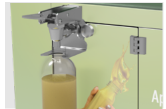
Self service tap

Very easy to use. The customer only needs to press the tap to activate the machine. It incorporates a practical bottle holder that maximises usability for the user, as it keeps the bottle fixed under the tap, preventing spillage and splashes, always keeping the filling area clean.