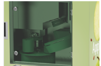
Patented Cold Press extraction system

With the innovative press and grating principle as a press basis, this juicer obtains the best juice yield and quality, thus, preserving the minerals and fibres naturally presents in apple. In addition, its original stainless-steel filter, guarantees the maximum durability.