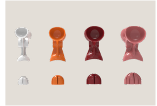
Juice extraction kits

Small (S): Grey; Medium (M): Orange; Large (L): Maroon; Extra large(XL): Pink.