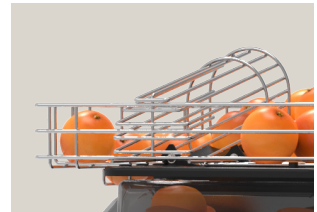
Standard contact sensor

The machine automatically starts up when the Contact sensor, included as standard equipment, detects the oranges on the ramp. It will also stop automatically when there are no oranges on the ramp, at which time the juicer goes into standby mode.