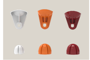
Juice extraction kits

Small (S): Grey; Medium (M): Orange; Large (L): Maroon.